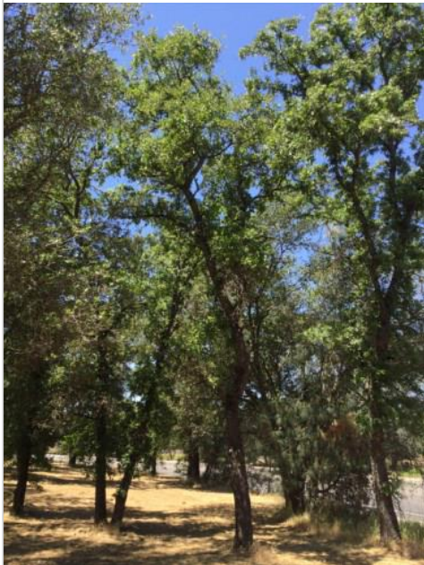
Oak, Valley Tag #: 227 Quercus lobata