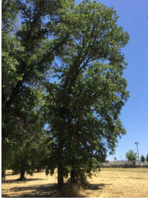
Oak, Valley Tag #: 243 Quercuslobata