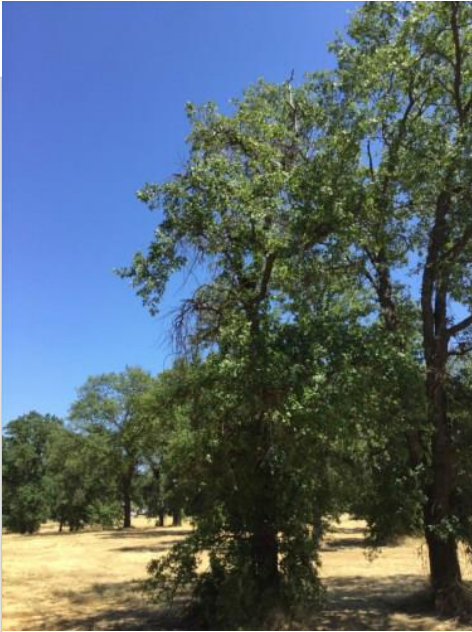
Oak, Valley Tag #: 248 Quercuslobata