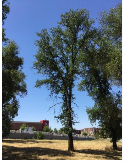
Oak, Valley Tag#:211 Quercuslobata