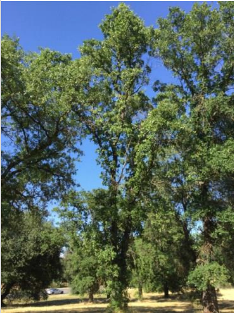
Oak, Valley Tag #: 282 Quercus lobata