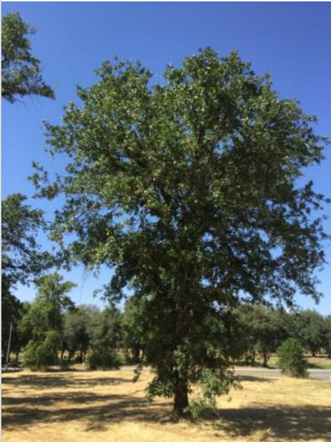
Oak, Valley Tag #:269 Quercuslobata