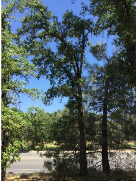
Oak, Valley Tag #: 219 Quercus lobata