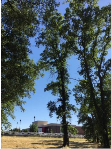
Oak, Valley Tag #: 283 Quercus lobata