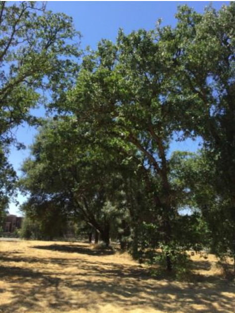
Oak, Valley Tag#:288 Quercuslobata