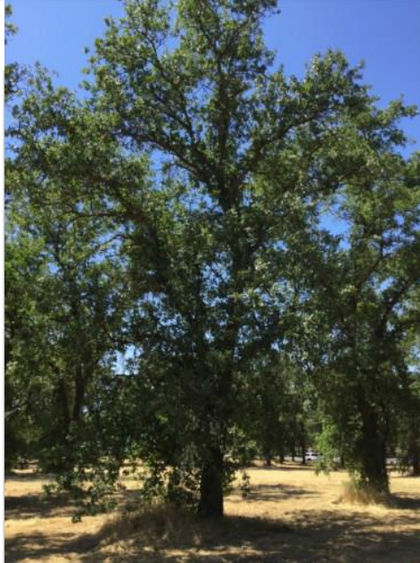
Oak, Valley Tag #: 255 Quercus lobata