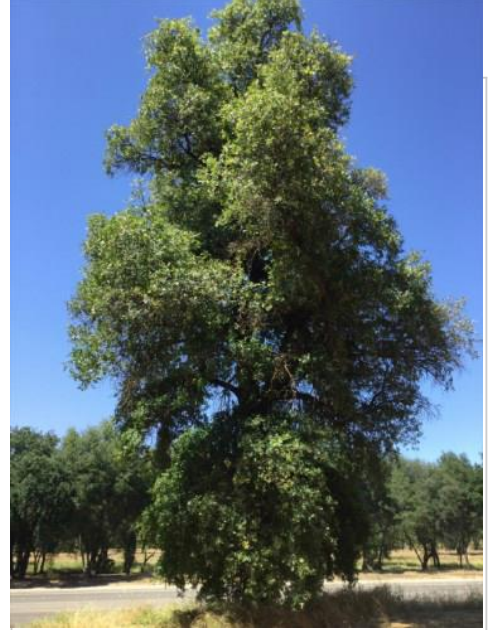
Oak, Valley Tag #: 262 Quercus lobata