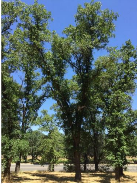
Oak, Valley Tag #: 222 Quercus lobata