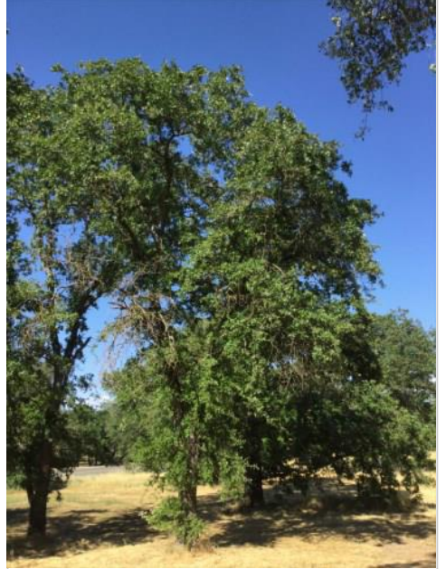
Oak, Valley Tag #:278 Quercuslobata