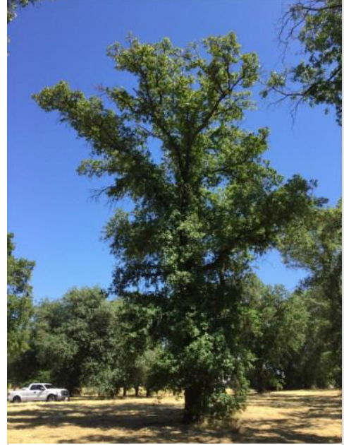
Oak, Valley Tag #: 265 Quercus lobata