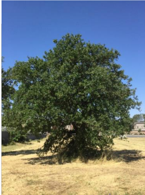
Oak, Valley Tag#:201 Quercuslobata