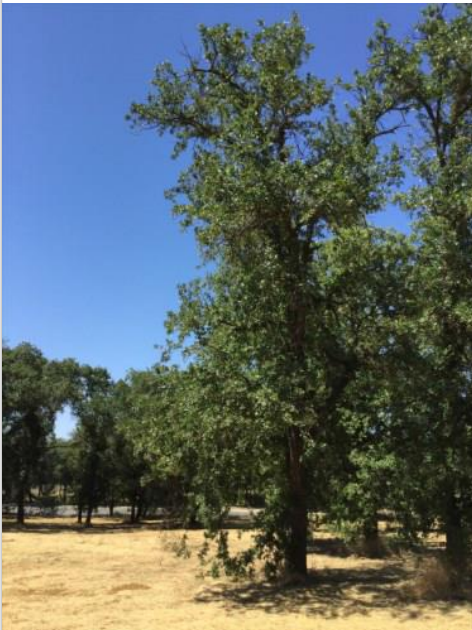
Oak, Valley Tag #: 257 Quercus lobata