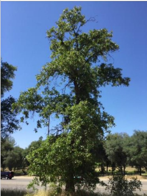
Oak, Valley Tag #: 263 Quercus lobata