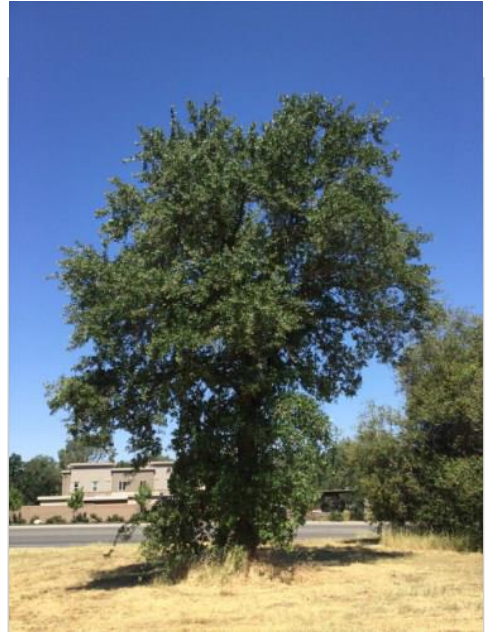
Oak, Valley Tag#:202 Quercuslobata