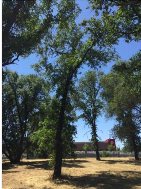
Oak, Valley Tag #: 216 Quercus lobata