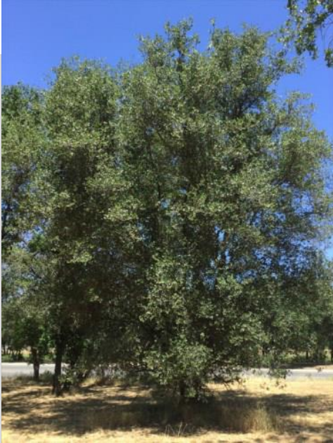
Oak, Interior Live Tag#: 230 Quercus wislizeni