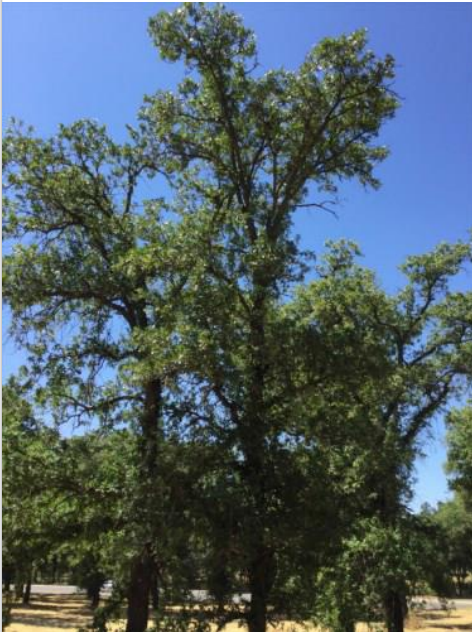
Oak, Valley Tag #: 251 Quercuslobata