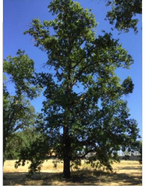
Oak, Valley Tag #:275 Quercuslobata