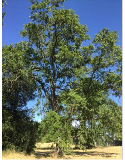
Oak, Valley Tag #: 284 Quercus lobata