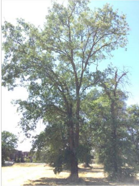
Oak, Valley Tag #: 240 Quercus lobata