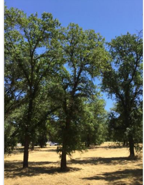
Oak, Valley Tag#: 235 Quercus lobata