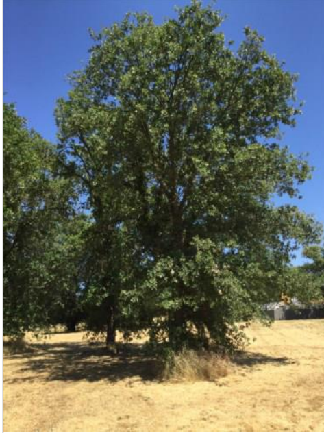
Oak, Valley Tag #: 252 Quercuslobata