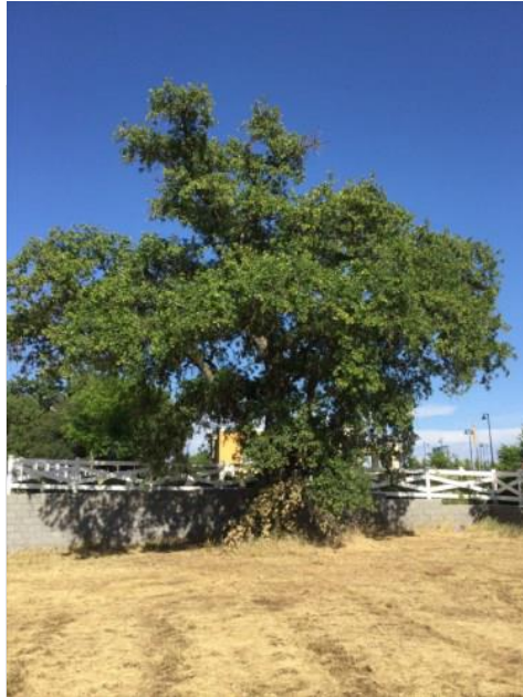
Oak, Valley Tag#:286 Quercuslobata