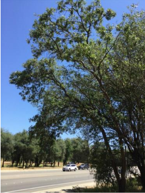
Oak, Valley Tag #: 224 Quercus lobata