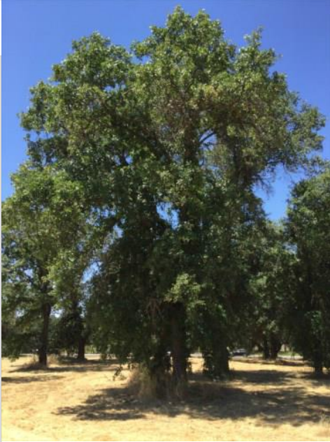
Oak, Valley Tag #: 242 Quercuslobata