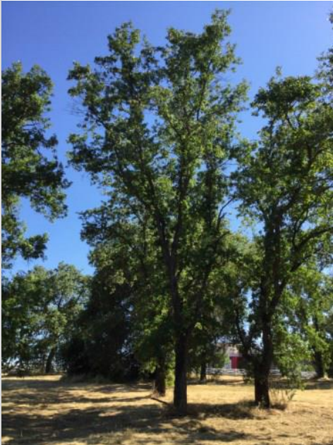
Oak, Valley Tag #:276 Quercuslobata