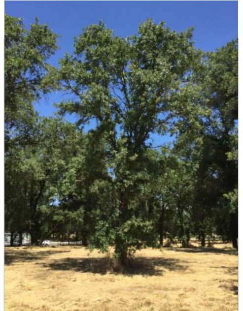
Oak, Valley Tag #: 238 Quercus lobata