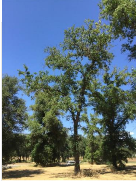
Oak, Valley Tag #: 261 Quercus lobata