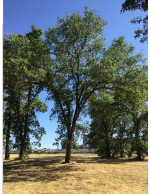
Oak, Valley Tag #: 281 Quercus lobata