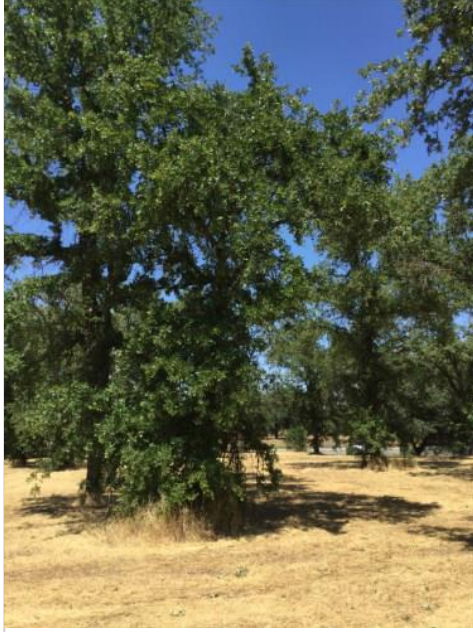
Oak, Valley Tag #: 249 Quercuslobata