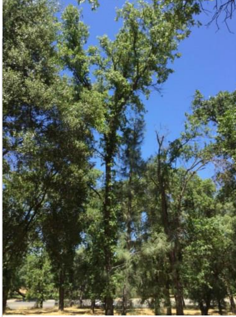
Oak, Valley Tag #: 237 Quercus lobata