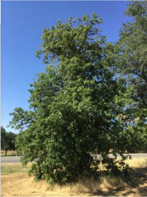
Oak, Valley Tag #:273 Quercuslobata