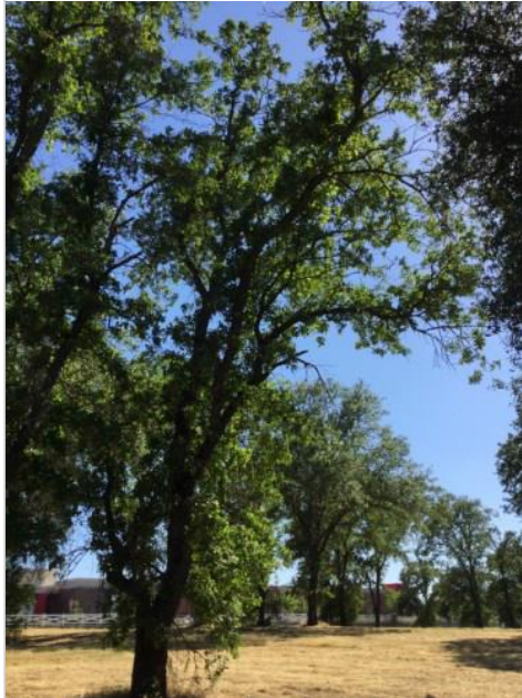
Oak, Valley Tag #:277 Quercuslobata