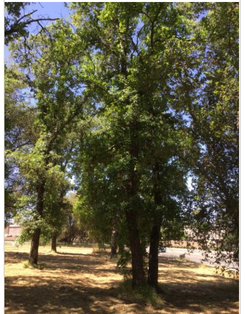
Oak, Valley Tag #: 229 Quercus lobata