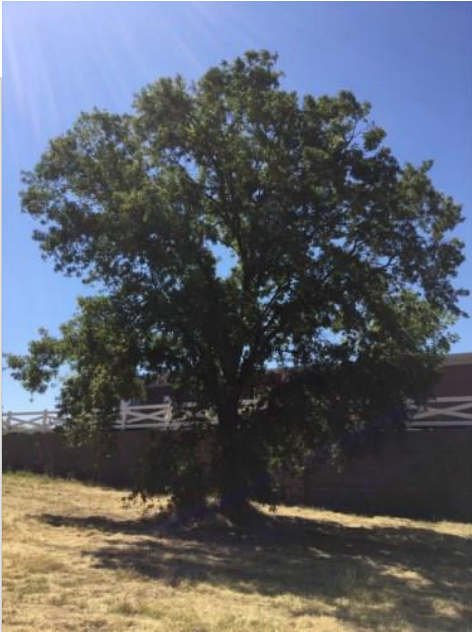
Oak, Valley Tag#:200 Quercuslobata