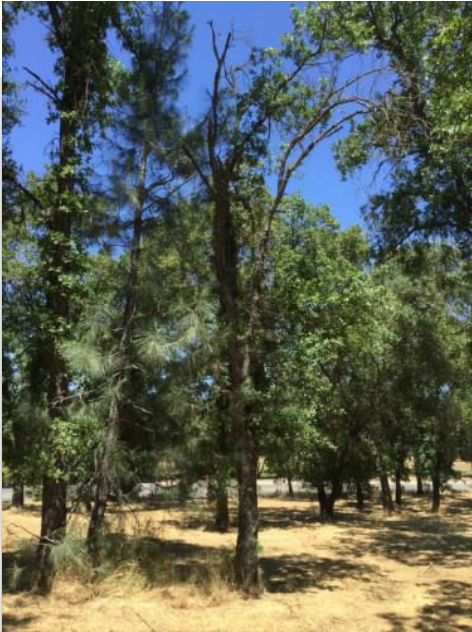
Oak, Valley Tag #: 236 Quercus lobata