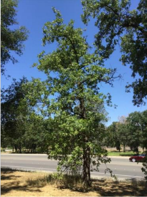
Oak, Valley Tag #: 218 Quercus lobata