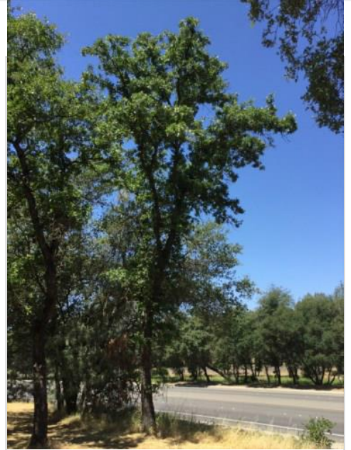
Oak, Valley Tag #: 226 Quercus lobata