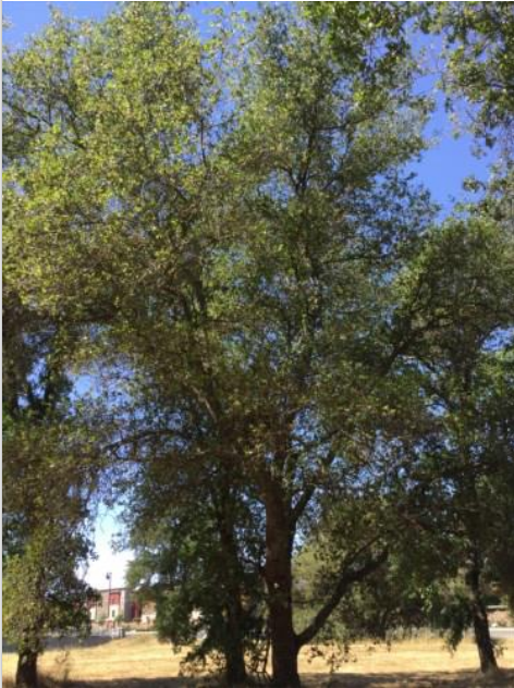
Oak, CoastLive Tag#:209 Quercus agrifolia