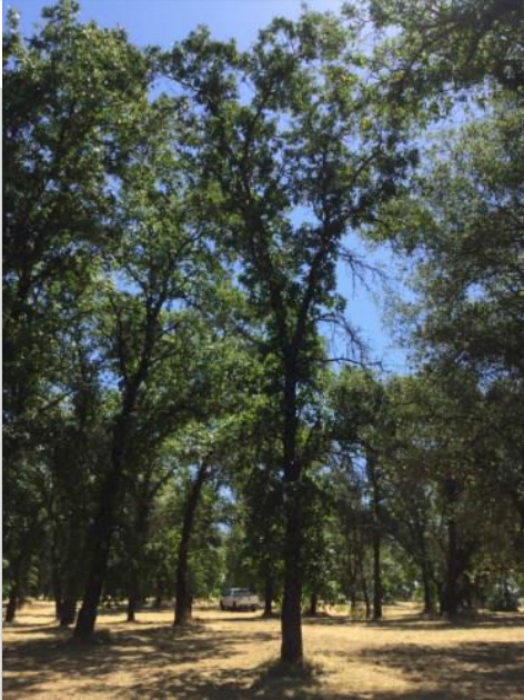
Oak, Valley Tag #: 212 Quercus lobata