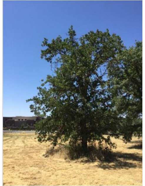
Oak, Valley Tag #: 241 Quercus lobata