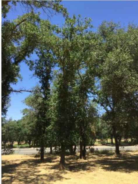
Oak, Valley Tag#: 231 Quercus lobata