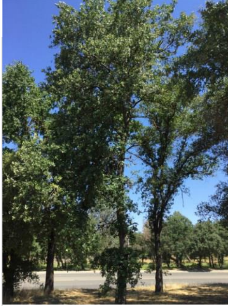
Oak, Valley Tag#:207 Quercuslobata