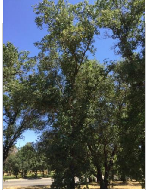
Oak, Valley Tag#:208 Quercuslobata