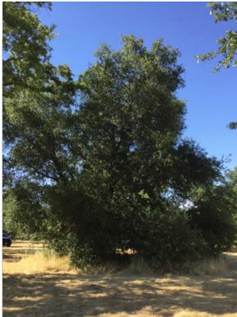
Oak, Interior Live Tag #: 280 Quercus wislizeni