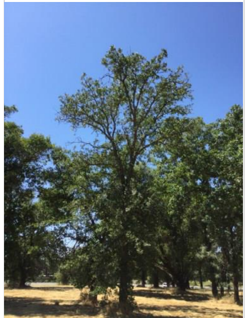
Oak, Valley Tag #: 247 Quercuslobata