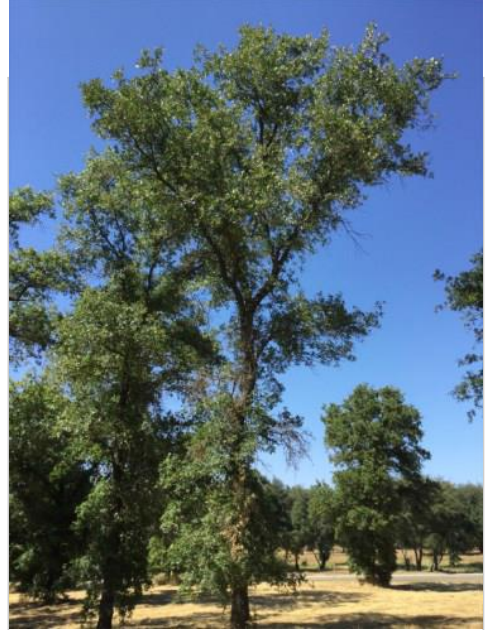
Oak, Valley Tag #:268 Quercuslobata