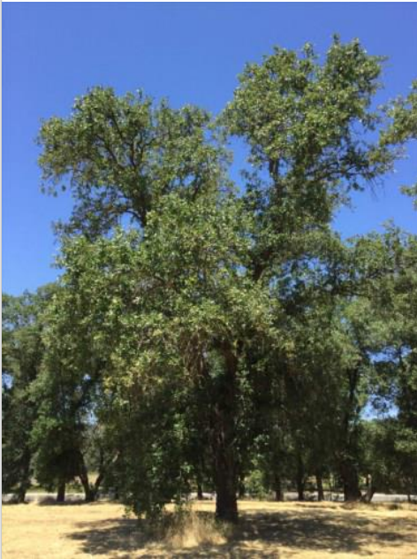
Oak, Valley Tag #: 239 Quercus lobata