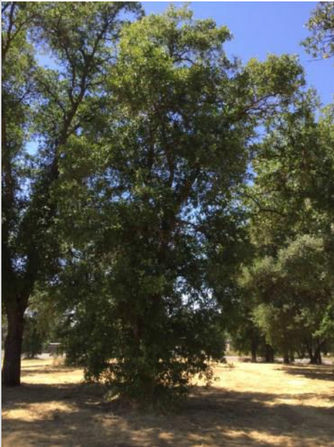
Oak, Valley Tag #: 245 Quercuslobata