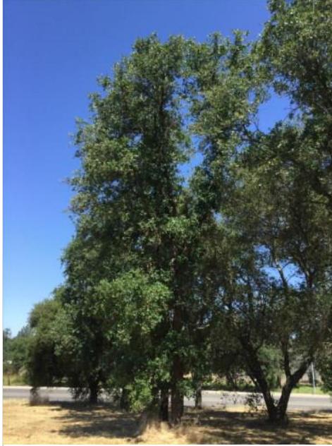
Oak, Valley Tag#:210 Quercuslobata