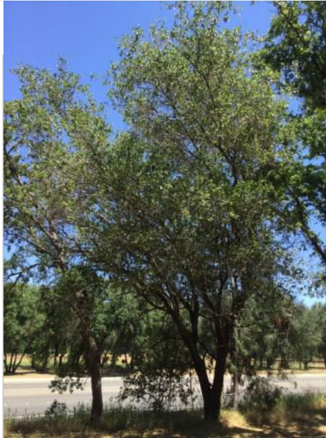
Oak, Interior Live Tag #: 225 Quercus wislizeni