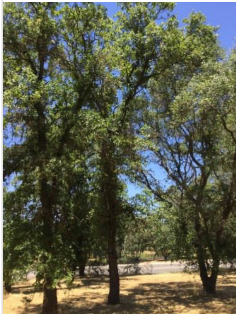
Oak, Valley Tag#: 234 Quercus lobata