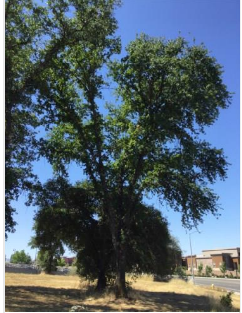
Oak, Valley Tag#:205 Quercuslobata