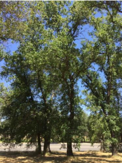
Oak, Valley Tag #: 215 Quercus lobata