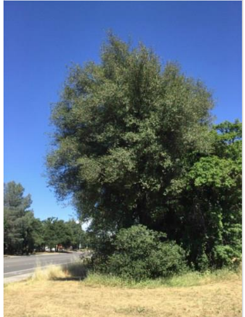
Oak, Interior Live Tag #:271 Quercus wislizeni