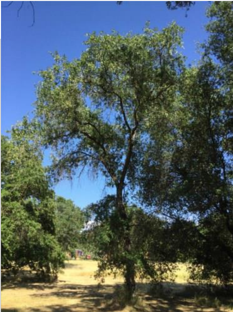
Oak, Valley Tag #: 279 Quercus lobata