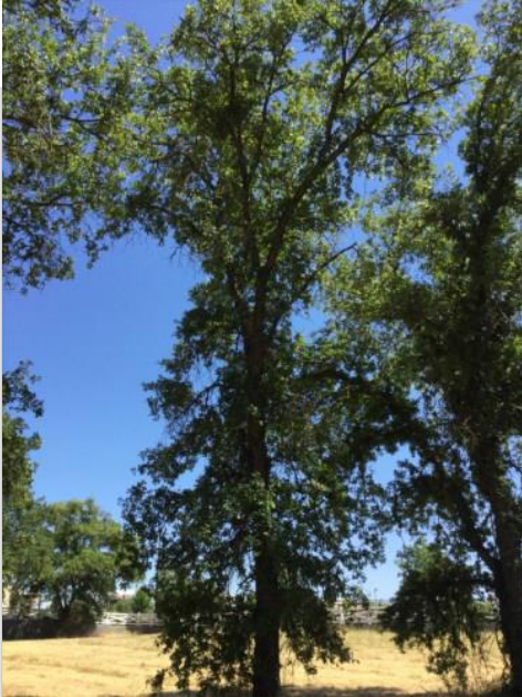
Oak, Valley Tag #: 254 Quercus lobata