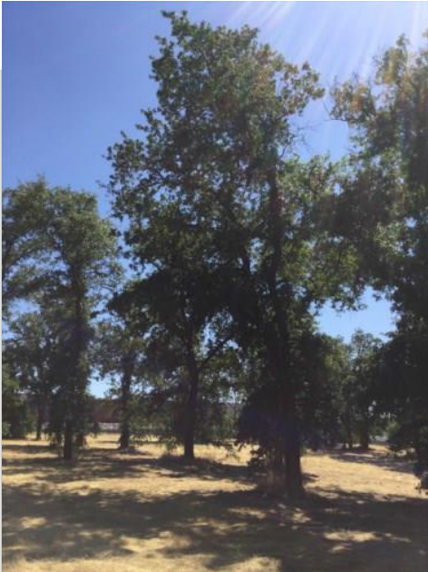
Oak, Valley Tag #:266 Quercuslobata