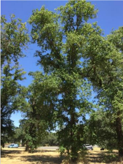
Oak, Valley Tag #: 260 Quercus lobata