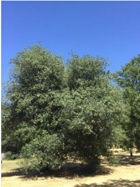
Oak, Interior Live Tag #:270 Quercus wislizeni