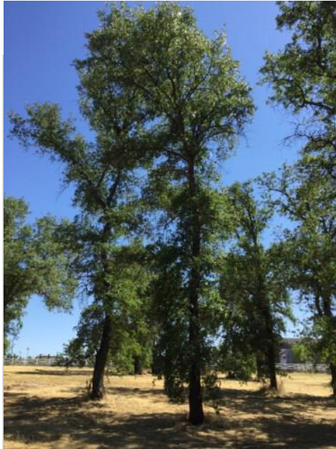
Oak, Valley Tag #:267 Quercuslobata