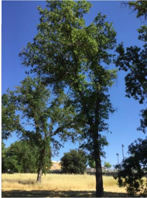
Oak, Valley Tag #:274 Quercuslobata