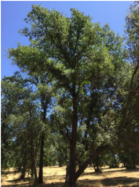
Oak, Valley Tag #: 228 Quercus lobata