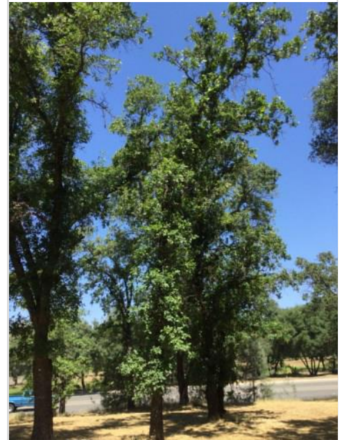
Oak, Valley Tag #: 223 Quercus lobata