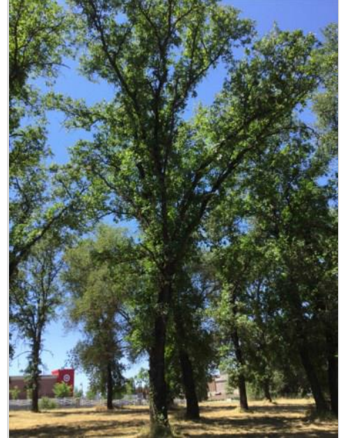
Oak, Valley Tag #: 217 Quercus lobata