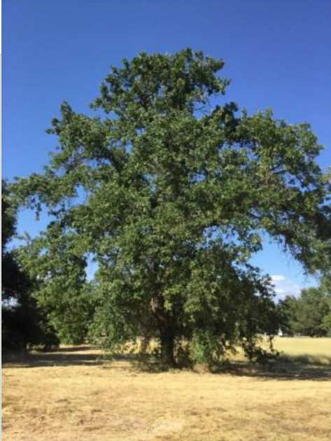
Oak, Valley Tag#:285 Quercuslobata