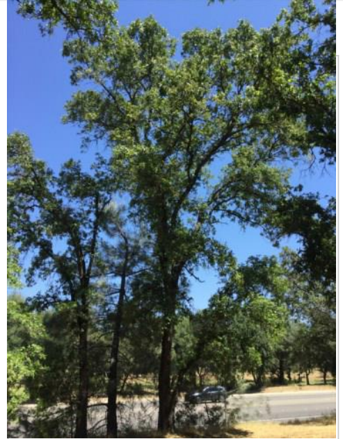
Oak, Valley Tag #: 220 Quercus lobata