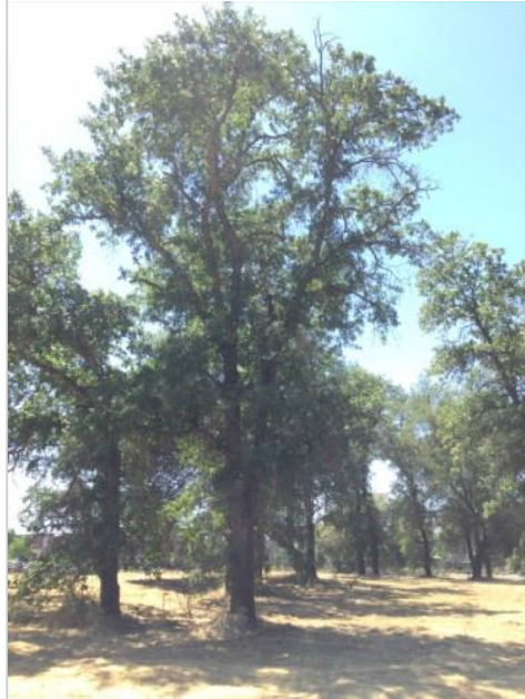
Oak, Valley Tag#:289 Quercuslobata