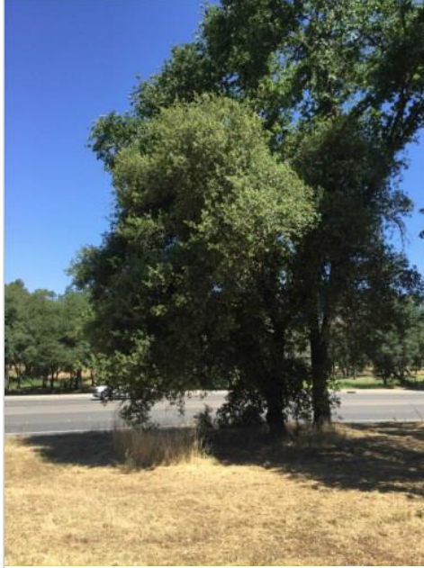
Oak, CoastLive Tag#:204 Quercus agrifolia