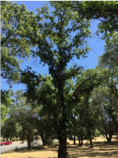
Oak, Valley Tag #: 221 Quercus lobata