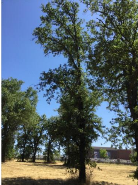
Oak, Valley Tag #: 258 Quercus lobata