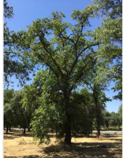
Oak, Valley Tag #: 259 Quercus lobata