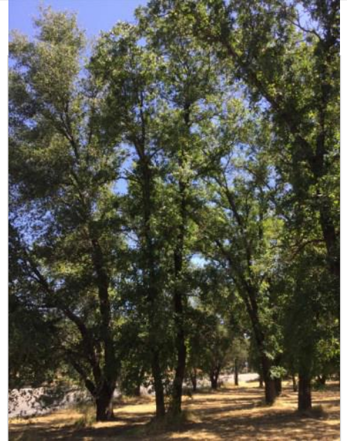
Oak, Valley Tag #: 214 Quercus lobata