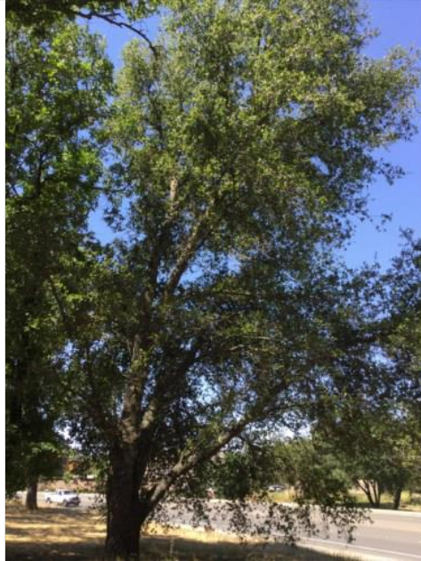
Oak, Interior Live Tag #: 213 Quercus wislizeni