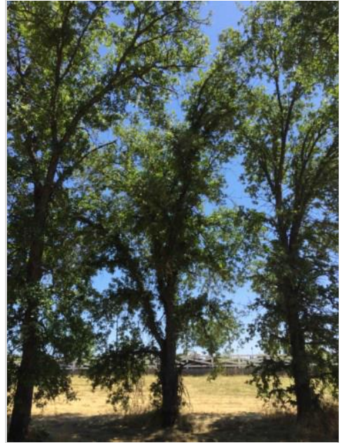
Oak, Valley Tag #: 253 Quercuslobata