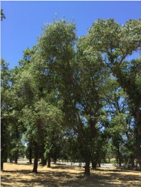
Oak, Valley Tag#: 233 Quercus lobata