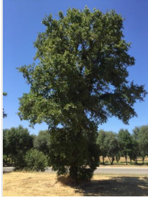
Oak, Valley Tag #: 264 Quercus lobata