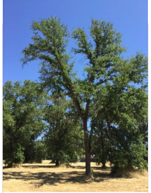
Oak, Valley Tag #: 250 Quercuslobata