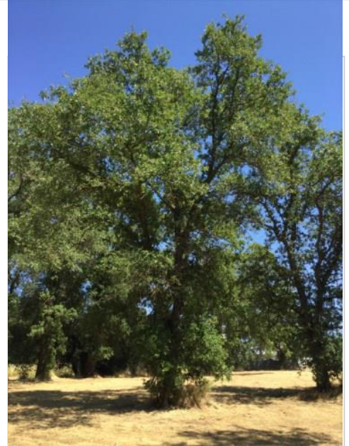
Oak, Valley Tag #: 256 Quercus lobata