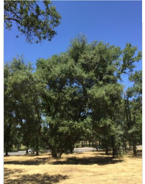
Oak, Interior Live Tag#:287 Quercus wislizeni