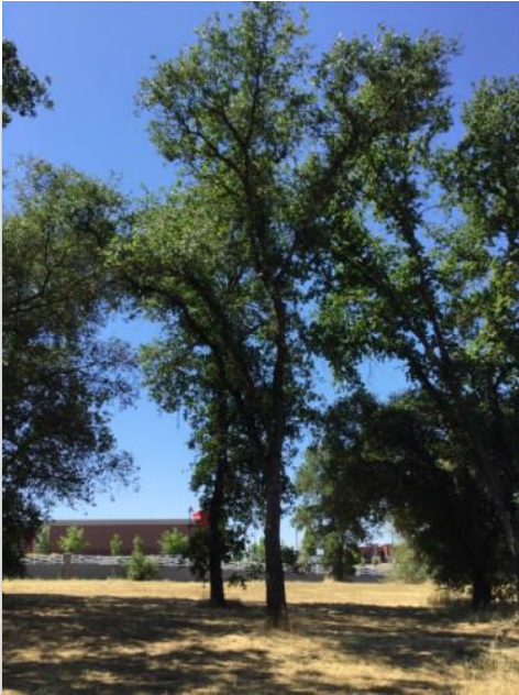
Oak, Valley Tag#:206 Quercuslobata