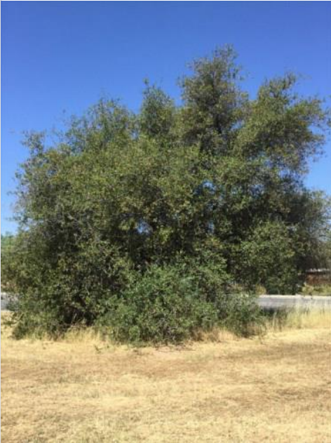
Oak, CoastLive Tag#:203 Quercus agrifolia