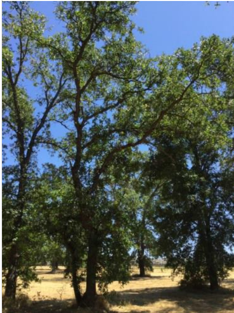
Oak, Valley Tag #: 246 Quercuslobata