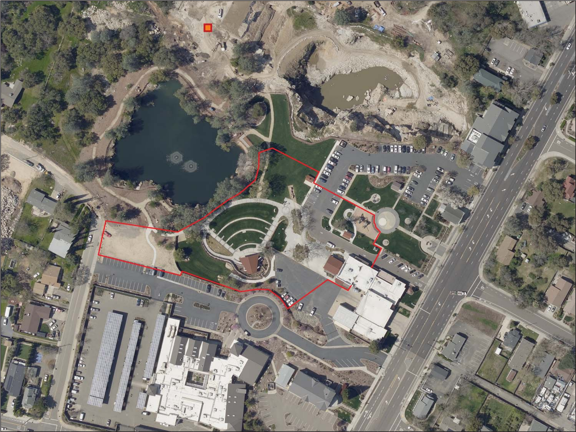
Premesis Map - Exhibit B