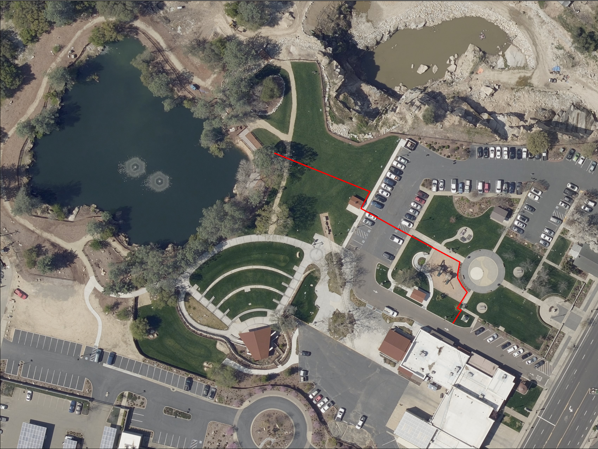
Fencing Diagram - Exhibit E