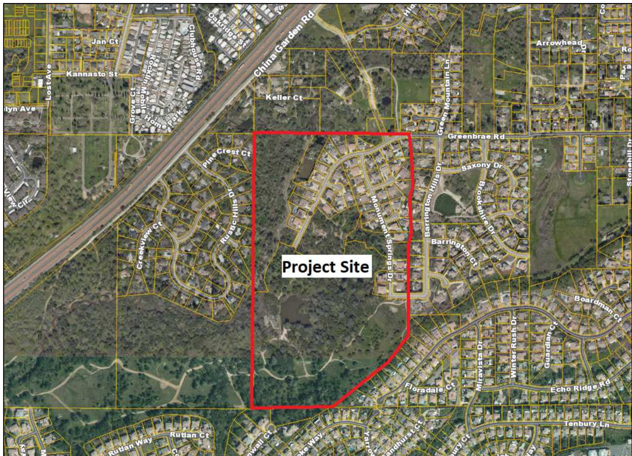
Figure 1 – Location Map

Phase 1 of the subdivision has been constructed, consisting of 48 single-family lots and a 10-foot wide paved trail through the open space area on the east side of Secret Ravine Creek. The remaining phases of the project, totaling 71 lots, cannot be developed until the Monument Springs Bridge has been constructed.