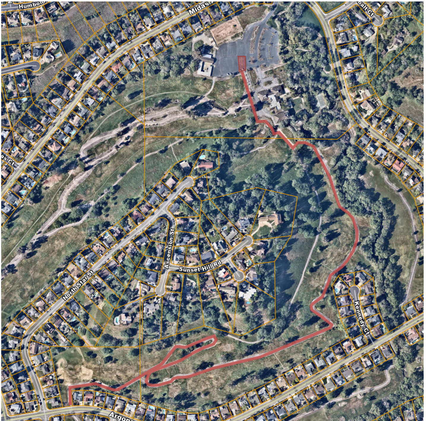
Grant Funded Work Locations