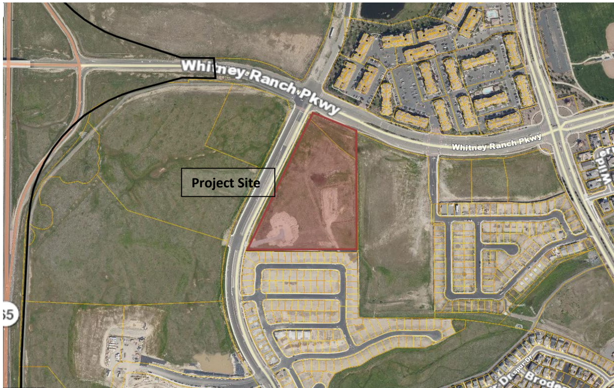
Figure 1 – Project Location