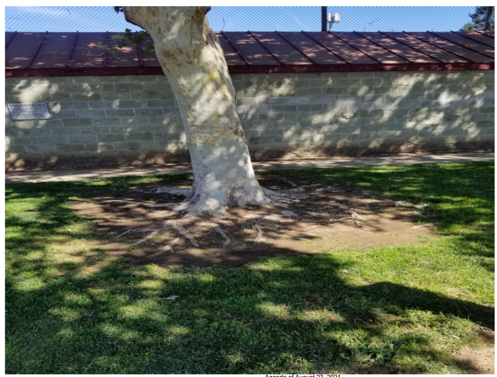
Agenda of August 23, 2021 Page 18 of 18