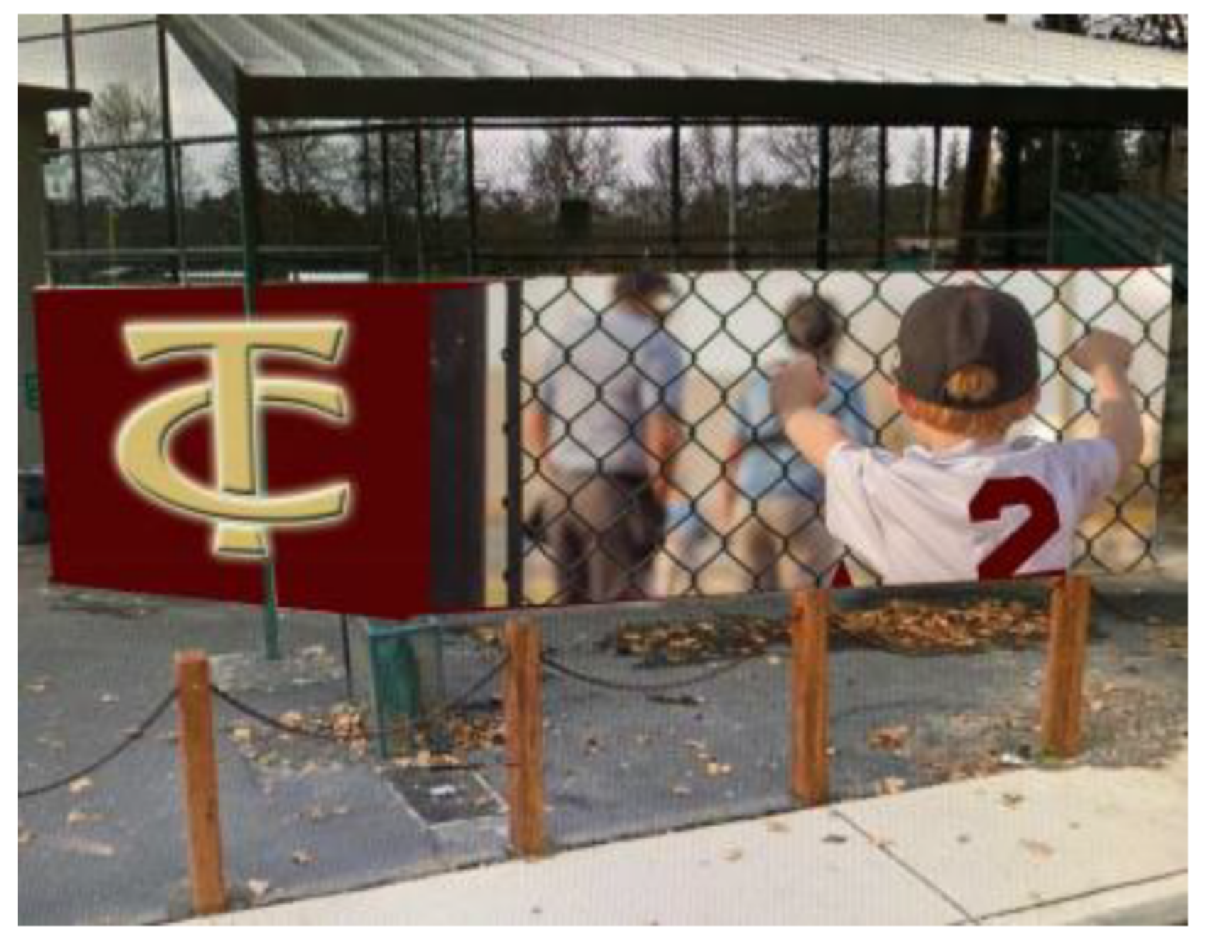
Agenda of August 23, 2021 Page 15 of 18